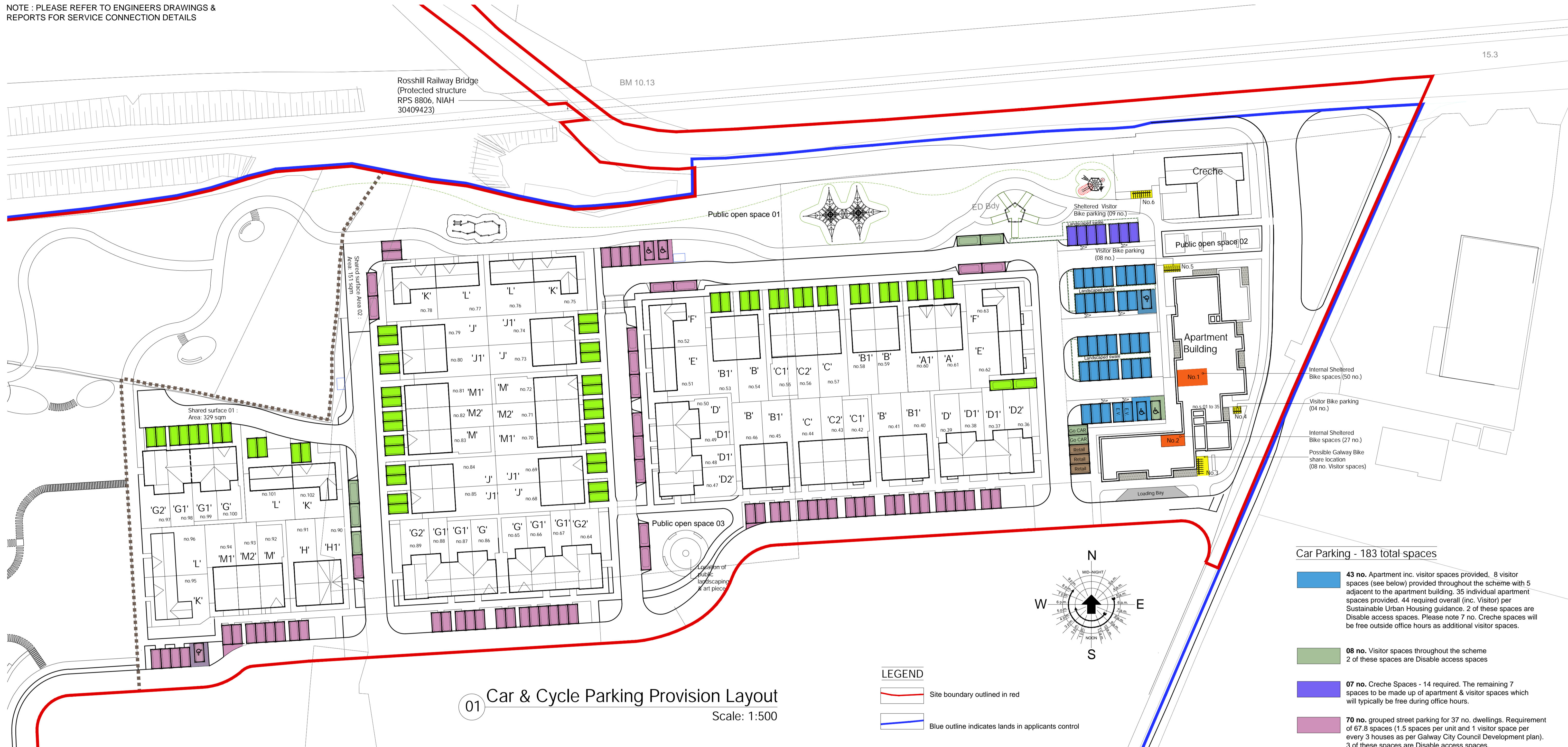
01 Car & Cycle Parking Provision Layout Scale: 1:500

NOTE : PLEASE REFER TO ENGINEERS DRAWINGS & REPORTS FOR SERVICE CONNECTION DETAILS